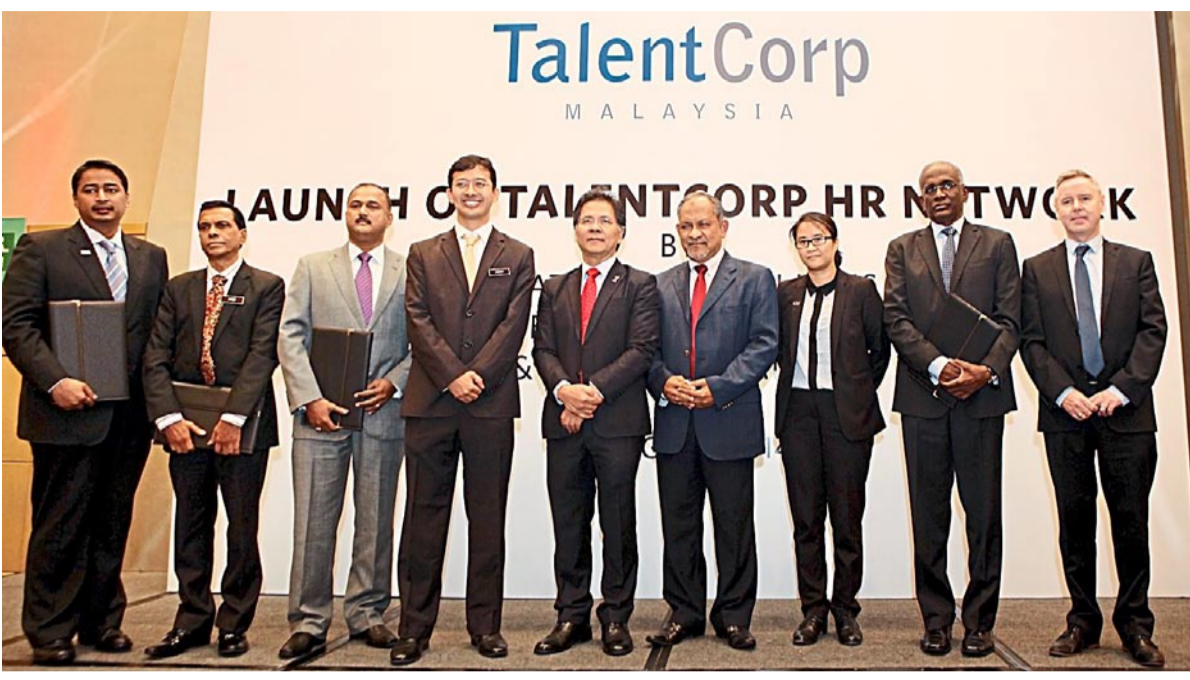
MoU exchange between TalentCorp and training providers of HR Certification Programmes in the presence of representatives from the Human Resources Development Fund and HR institutions, witnessed by Datuk Seri Idris Jala.