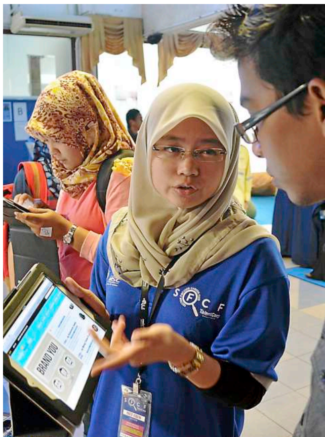
SFCF Universiti Teknologi MARA.